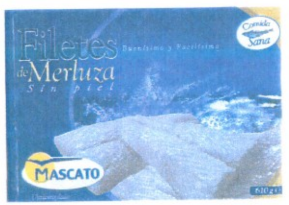
SKINLESS HAKE FILLET