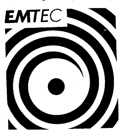
FILED: 8 DECEMBER 1998

Address for service: HAHN & HAHN c/o Lorentz & Bone, 12 & 13th Floors, Frans Indongo Gardens, Bülow Street, Windhoek.