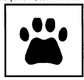
FILED: 2 NOVEMBER 1995

Address for service: Messrs. FAIRBRIDGE ARDERNE & LAWTON, 16<sup>th</sup> Floor, Main Tower, Standard Bank Centre, Heerengracht, Cape Town, 8001. R1-910 .