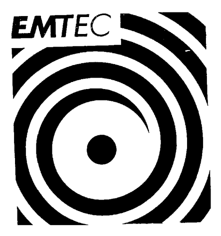
FILED: 8 DECEMBER 1998

98/1688 in Class 16: Copy secure film, transparencies, especially for laser printers and overhead projectors; adhesive labels for printers and copy machines, inkjet paper; screenfilters for computer monitors. In the name of EMTEC MAGNETICS GmbH ; in the name of Kaiser Wilhelm Strasse 52, Ludwigshafen, Germany. Address for service: HAHN & HAHN c/o Lorentz & Bone, 12 & 13th Floors, Frans Indongo Gardens, Bülow Street, Windhoek.