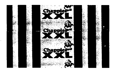
FILED: 19 OCTOBER 2000

Address for service: KISCH ASSOCIATES, 17 Currie Street, Windhoek West, 9000 Windhoek, Republic of Namibia.