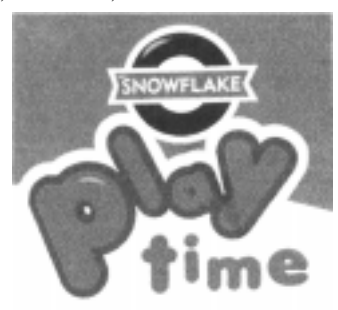
FILED: 3 June 2005

Address for service: MESSRS ADAMS & ADAMS, c/o 12 Love Street, Windhoek, Namibia.