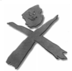
FILED: 27 April 2005

Address for service: MESSRS. ADAMS & ADAMS, 12 Love Street, Windhoek, Namibia.