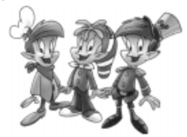
FILED: 12 May 2005

Address for service: ADAMS & ADAMS, 12 Love Street, Windhoek, Namibia.