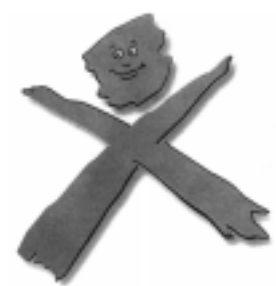
FILED: 27 April 2005

Address for service: MESSRS. ADAMS & ADAMS, 12 Love Street, Windhoek, Namibia.