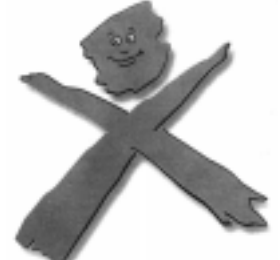
FILED: 27 April 2003

Address for service: MESSRS. ADAMS & ADAMS, 12 Love Street, Windhoek, Namibia.